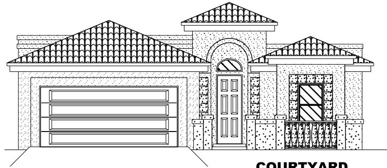
COURTYARD FRONT ELEVATION