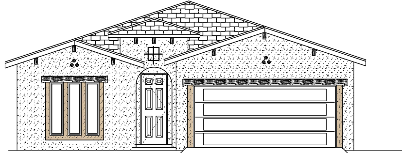
FRONT ELEVATION "A"