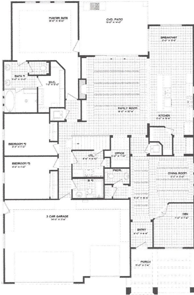
FIRST FLOOR PLAN W 52'-5" X D 13'-1"