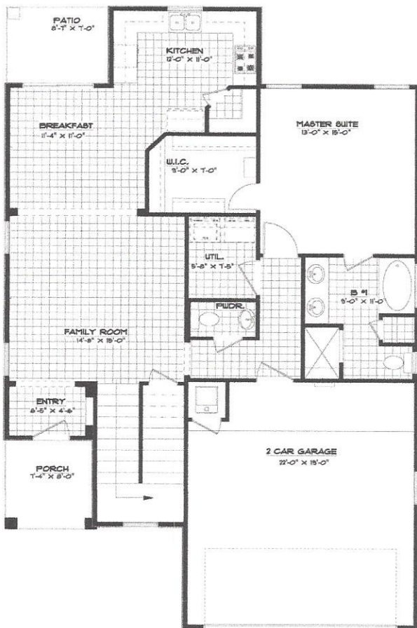
FIRST FLOOR PLAN W 34'-6" X D 56'-2"