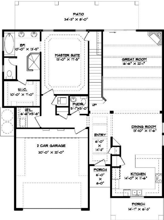
FIRST FLOOR PLAN 44'-6" x 49'-9"

2821SQFT. – 4 BEDROOMS – 3.5BATHROOMS – 2 CAR GARAGE